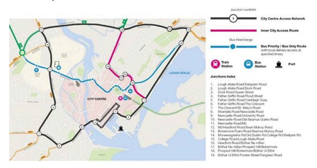
Plate 1: City Centre Access Network

The core city centre area inside of the City Centre Access Network, will see road space reallocated to prioritise public transport and active modes. This will in turn facilitate public realm improvements along the Cross-City Link corridor, but requires changes in movements for private cars within the city centre to facilitate this. The city centre remains accessible, but priority is no longer given to the private car in this area or to the through movement in this area. This is best explained graphically in Plate 2 below.